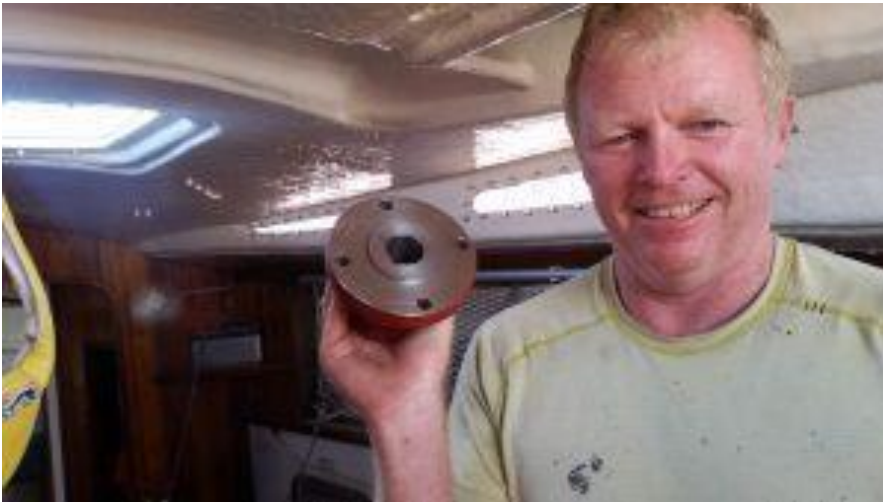
newly machined shaft coupling

We thought a week would be long enough to do the anti-fouling and replace the shaft seal. The leaky shaft seal escalated from installing a $20 seal kit to several thousand dollars over 2 weeks to replace the complete unit and machine a new shaft coupling.