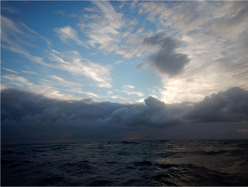
SW squall – welcome home

Calm winds added a couple of days to the passage – stay out here long enough and you are bound to encounter a SW front, which we did on Friday night. At 25-30kts, it was relatively mild and enough to shorten sail by two reefs. The ride upwind can be pretty bumpy and that can also make ablutions challenging – the head became known as the ‘Rodeo Seat’ after those moments you are airborne, which strike a moment of terror as you imagine landing with your genitals between the seat and bowl.