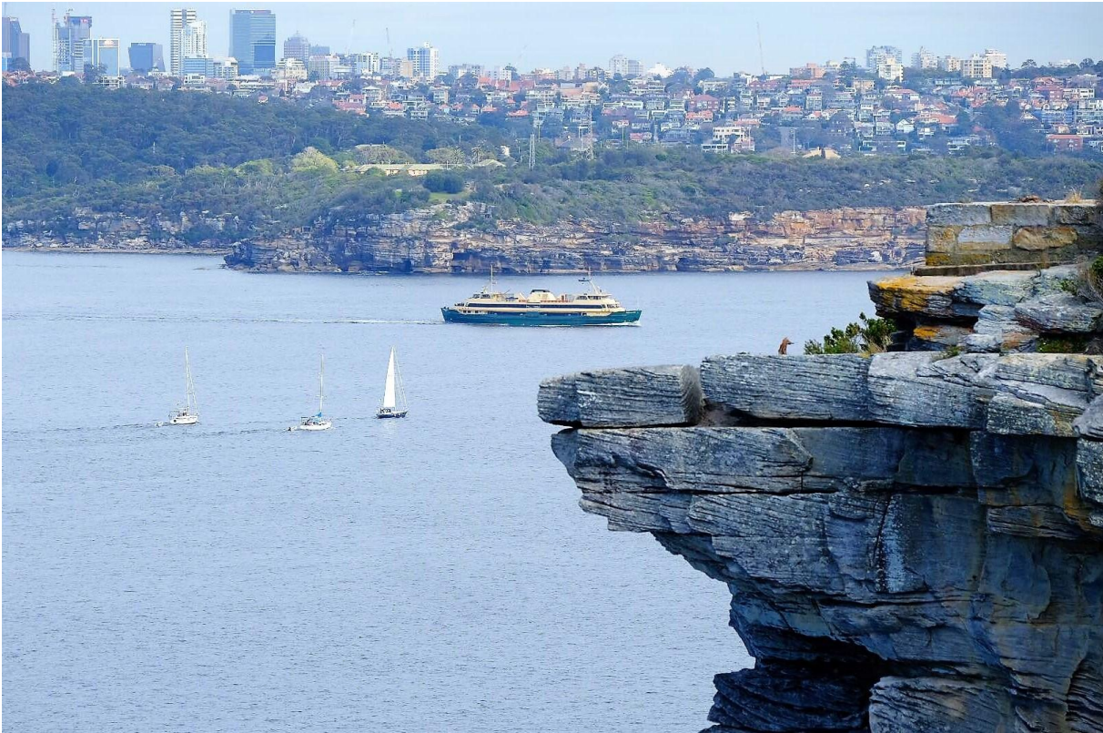
Being escorted through Sydney heads